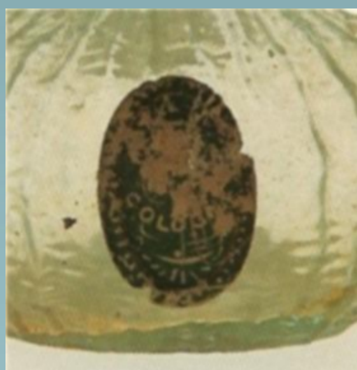
Paper label from a similar bottle from a private collection.